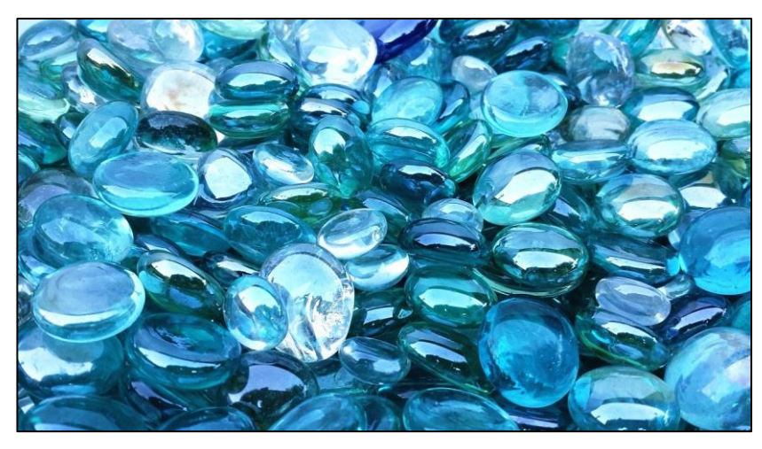
"We are all seen...."