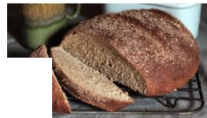
Grant loaf by Elaine Pascale