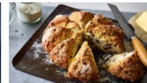
Spotted dick bread by Nadiya Hussain