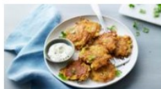
Classic latkes by Annie Rigg