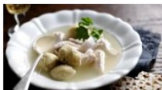
Chicken soup and dumplings by Simon Rimmer