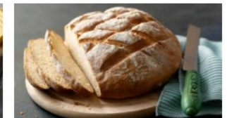
Easy white bread by Paul Hollywood

Make Easter fruit cupcakes: https://www.bbc.co.uk/food/recipes/easter-fruit-cupcakes-75736