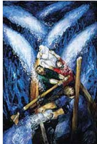
Be Calm by Sieger Koder

Mindfulness simply means paying attention to our experience in the present moment, on purpose and with an attitude of kindly acceptance. Used widely for stress reduction, can it help us to be free from the stress of living in today’s world? Can it really bring freedom to frantic lives? A ‘for anyone’ practical workshop on using Mindfulness stress reduction in everyday life.